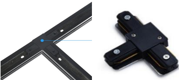
T 270° connector