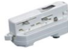
4wires adaptor (3 circuits/three phase) White,Black,Silver