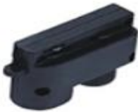
2 wires track system (single phase) White,Black,Silver

Different track heads must match with above relative tracks.