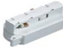
3 wires adaptor White,Black,Silver