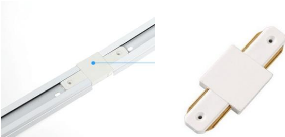
I 180° connector